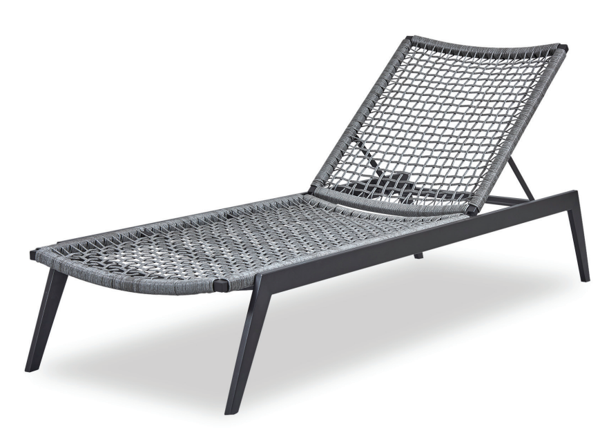
Sunbrella - Cast slate