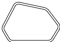
Quartz - TYPE B