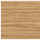
Stained ash veneered